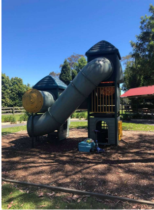
Play Equipment Area