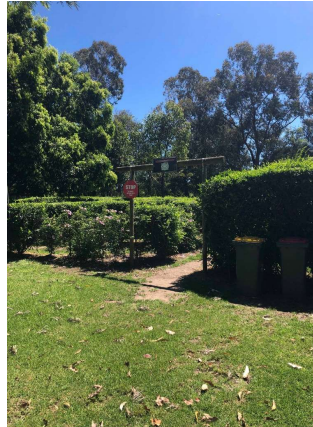
Entry and exit points of the mazes