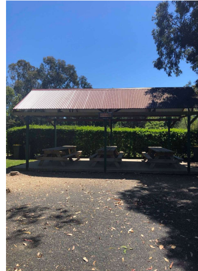
Shaded recess, lunch, rest and bag area