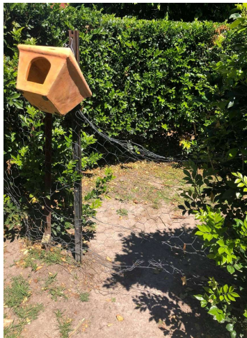
Exposed wire fence within the maze grounds