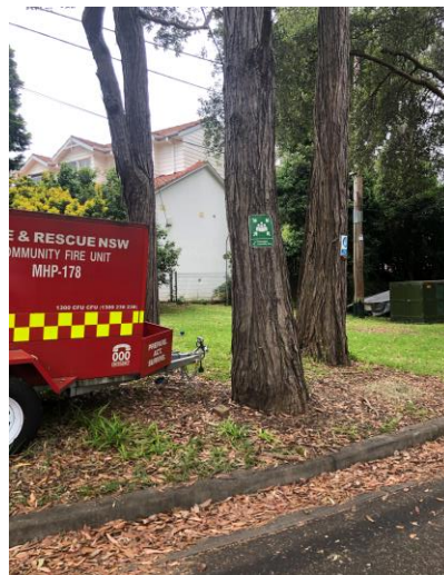
Evacuation assembly point (green sign)