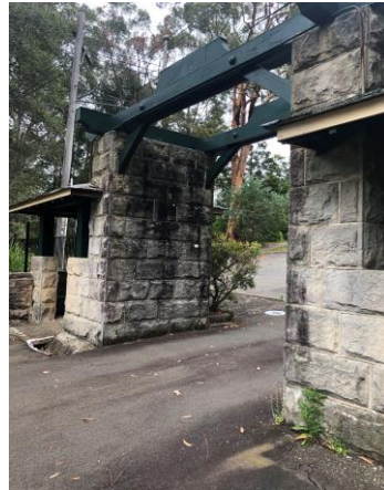
Entry/ Archway- Bus will drop outside here