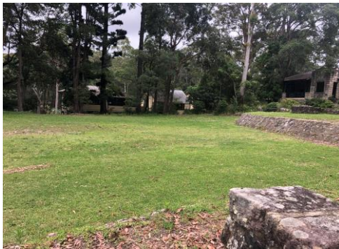
Pioneering activity area