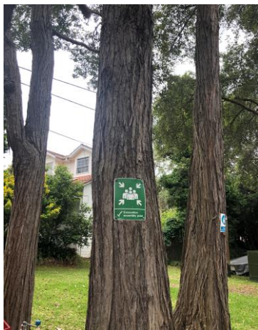
Evacuation assembly point