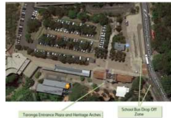
Entry & Exit of venue