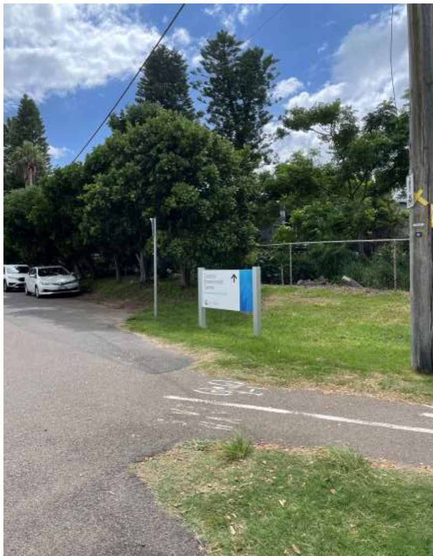
Bus will drop the children at this white sign and educators and children will assemble in two lines on the pathway with the lanes marked