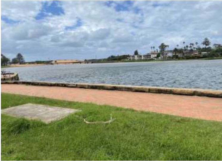
Educators to position themselves closest to the waters edge whilst walking