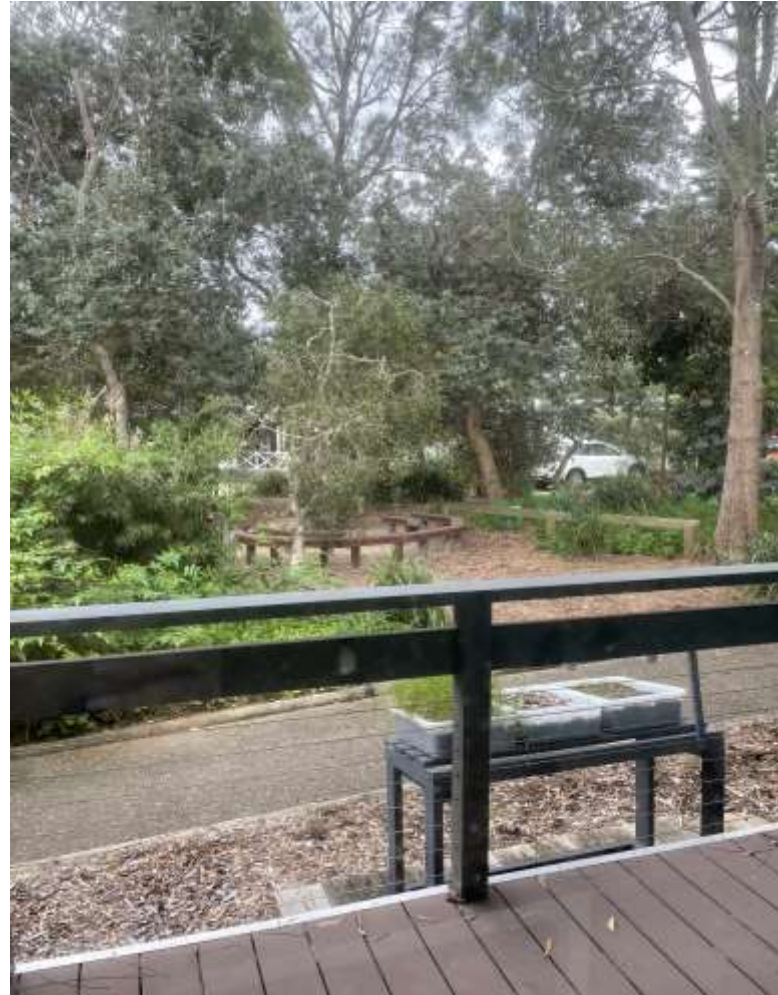
Children can eat out here if weather permits