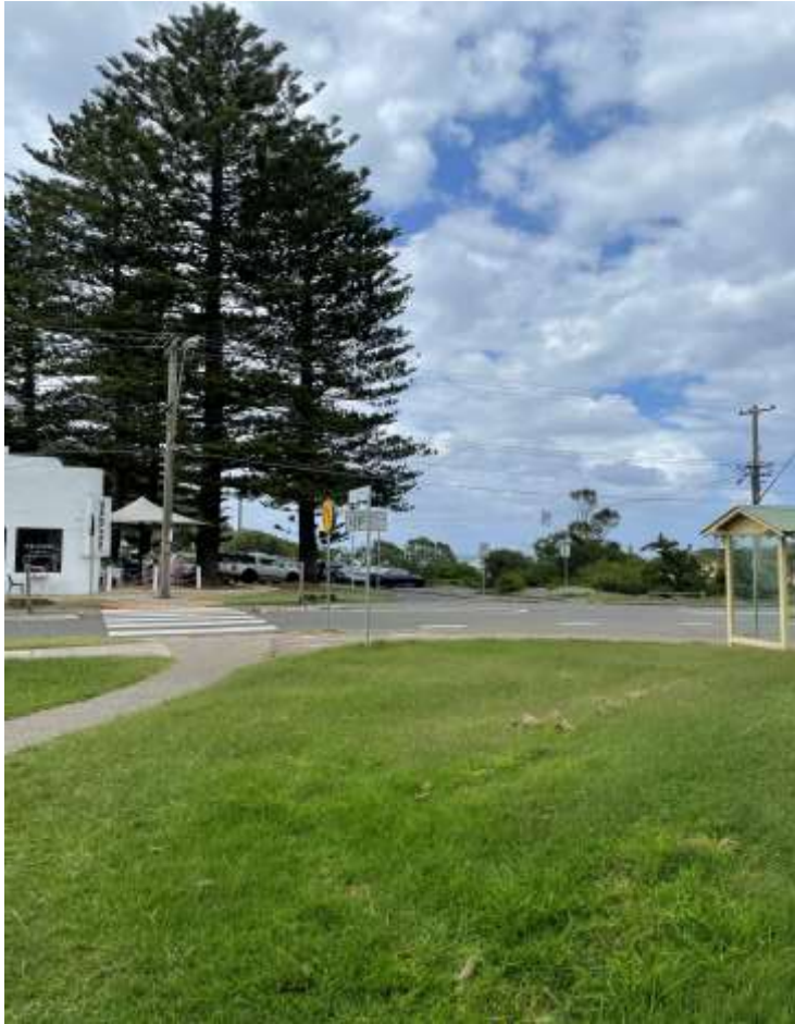
Potential crossing to be used by older children to go to kite flying area if numbers are higher