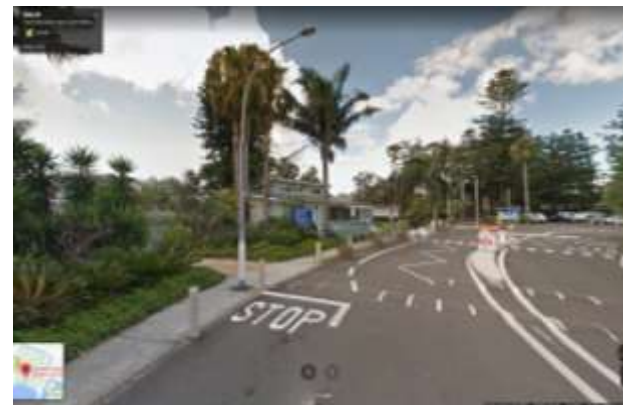
Entry & Exit of venue