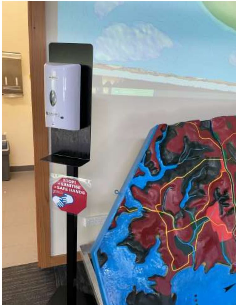
Hand santisier available prior to and following the childrens use of all activities inside