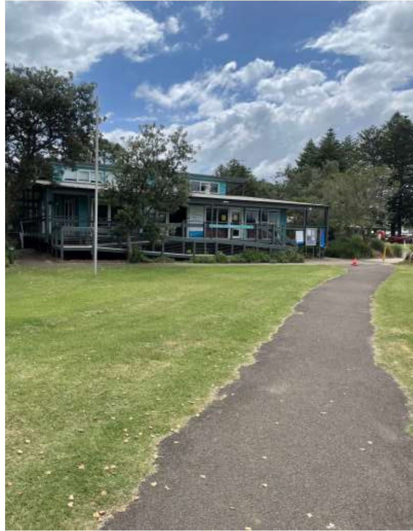
The entrance of the CEC