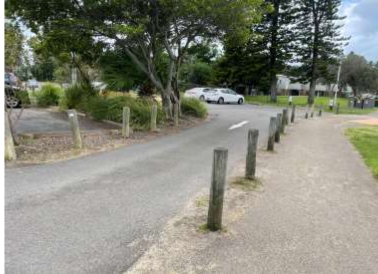
Walking pathways adjacent to the carpark