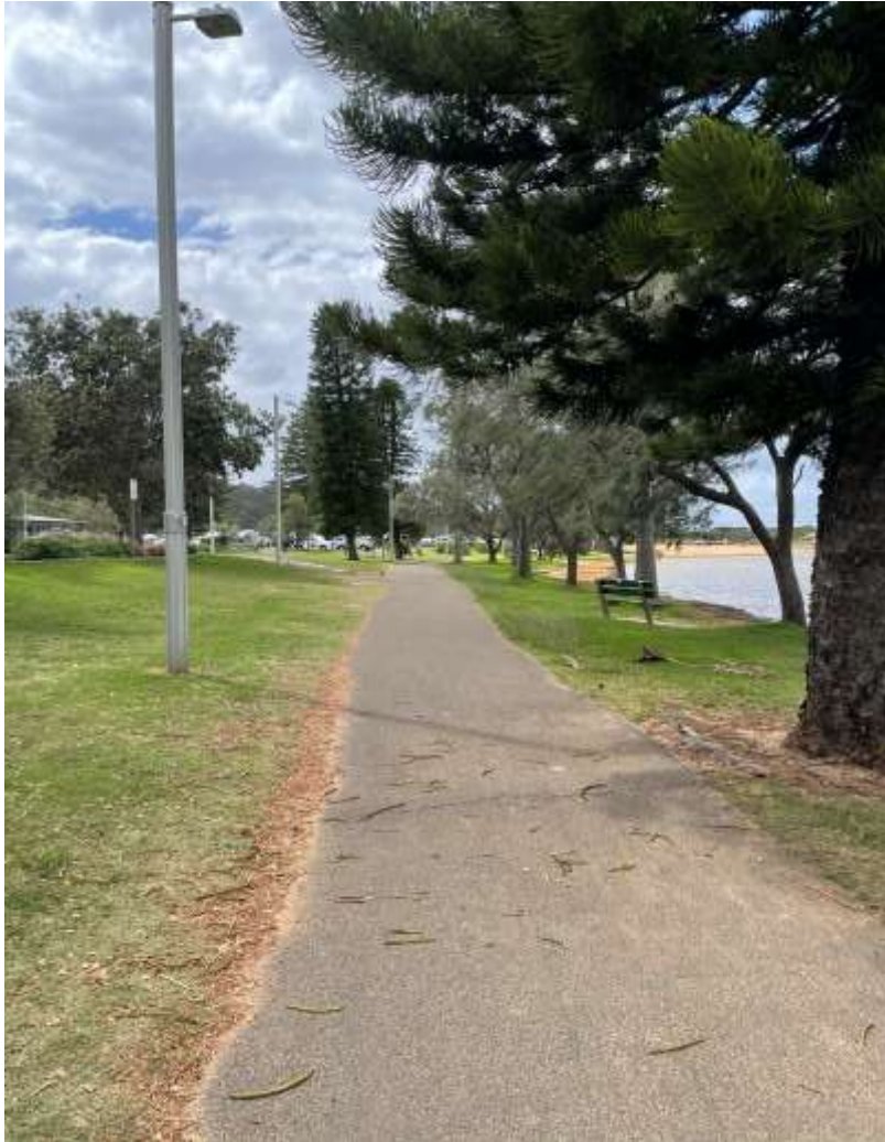
Educators will ensure they are walking on the side closest to the water at all times