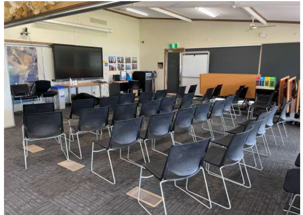
Indoor meeting area of the CEC- Here the children will assemble their kites