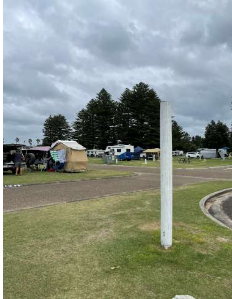
Caravan park adjacent to the CEC