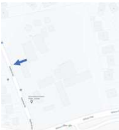
Exit & Entry of premises Via School Gate 5