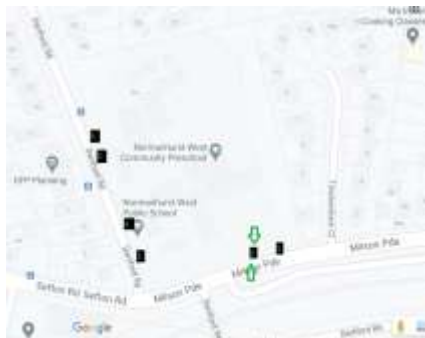
Exit & Entry of premises Via School Gate 2