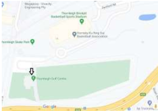
Entry & Exit to venue via front stairway adjacent to carpark