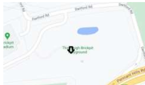
Entry & Exit of venue Via lower entrance next to park benches