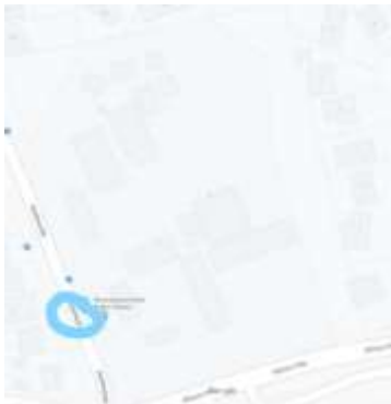
Exit & Entry of premises Via School Gate 3