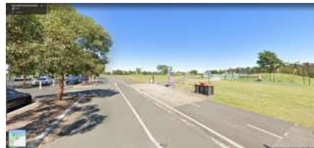
Entry & Exit of venue