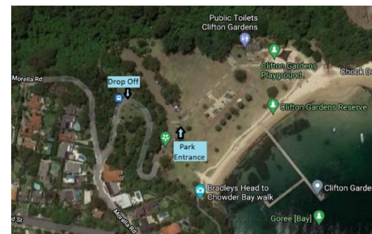
Entry & Exit of venue