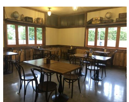
Café area where children can leave their bags during factory tour