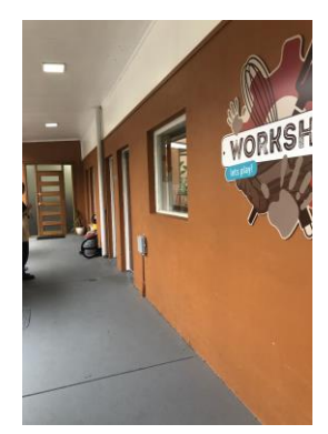
Walkway to toilets (Adjoining to carpark area)