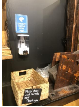
Hand Sanitizer and hair net are