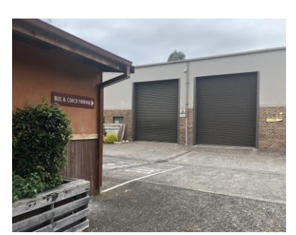
Bus and Coach Parking / drop off and pick up zone