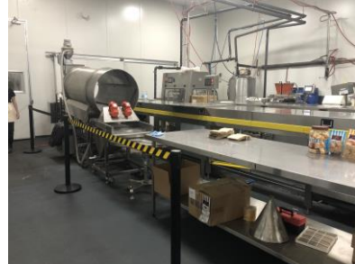
Factory Area with barriers placed around equipment