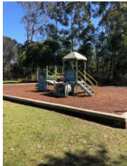
Play Equipment at Lambert's Clearing