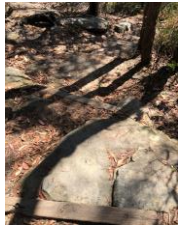
Rocky terrain on bush walking tracks