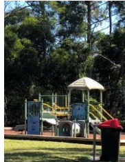
Play Equipment at Lambert's Clearing