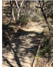
Wooden walkways on bush walking tracks