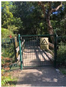
Boardwalk entry to pond