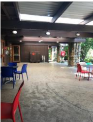
Sheltered eating and activity area at Caley's Pavillion