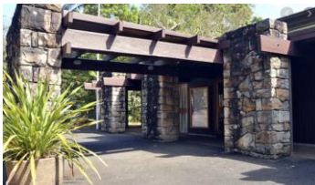
Caley's pavilion entrance and drop off point/pick up point for bus