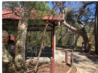
Additional eating area at dampiers clearing