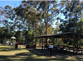
Lunch area at Lambert's clearing (includes taps, toilets and water bubblers)