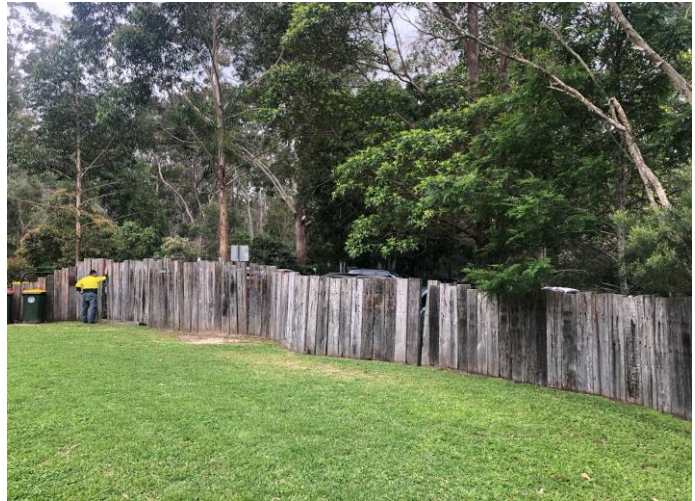
grassed eating area and emergency evacuation point