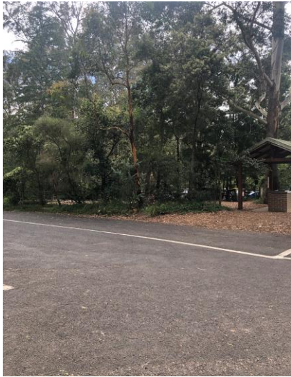
coach parking spot