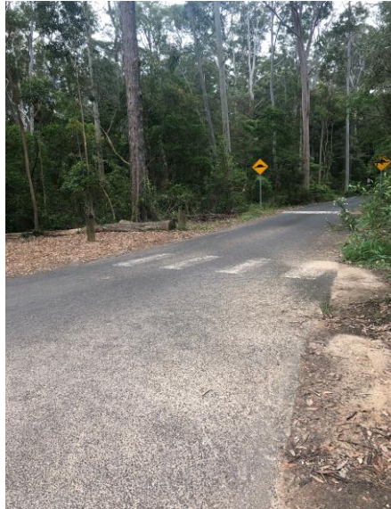
Zebra Crossings to be used by educators and children