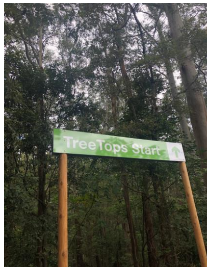
Tree tops walking path start sign