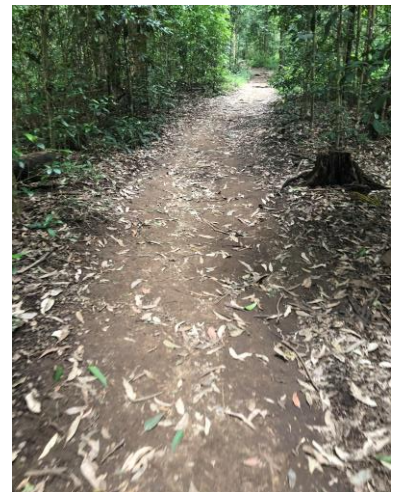
walking path to climbing course