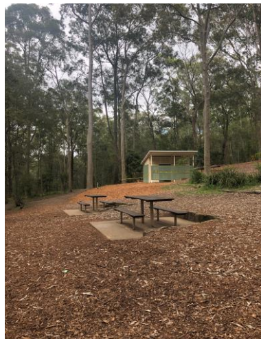
New toilet block adjacent to tree tops climbing course