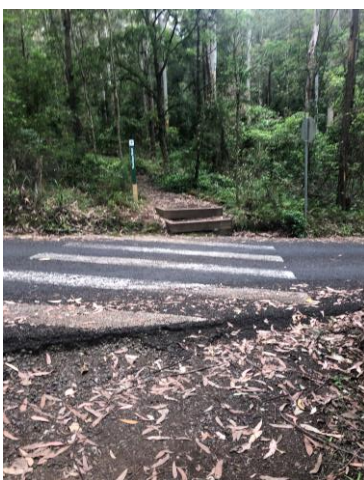
Zebra crossing to be used by educators and children