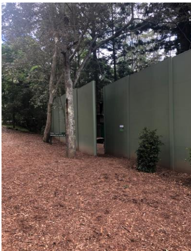
Exit of the park to the residential area