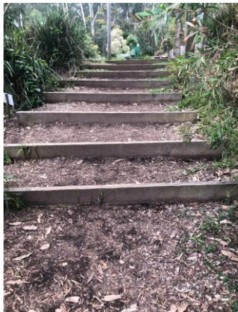
Steps on walking path to climbing course