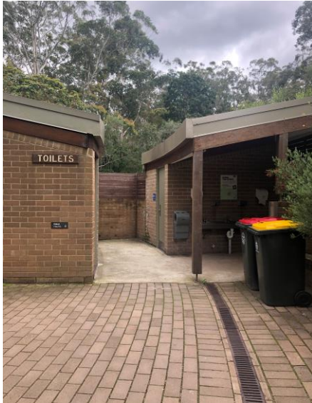
Main toilet block near grassed area