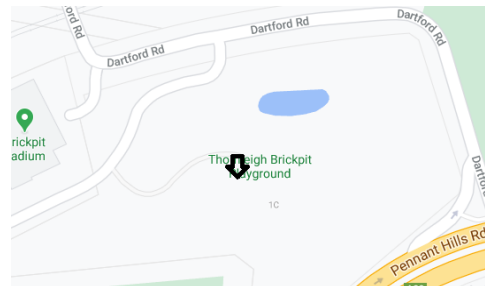
Entry & Exit of venue Via lower entrance next to park benches