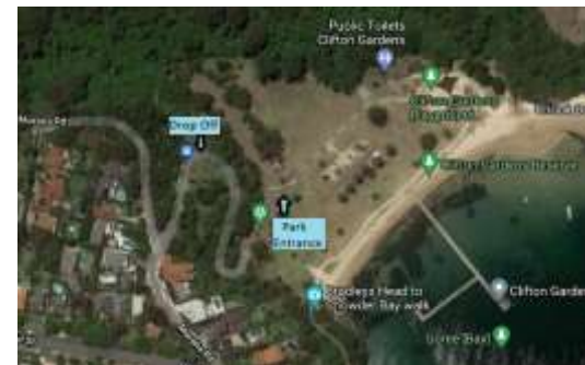
Entry & Exit of venue