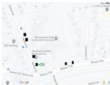
Exit & Entry of premises Via School Gate 3