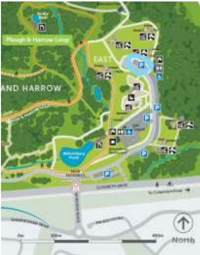
Entry & Exit of venue