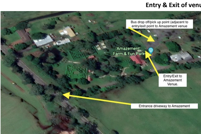
Entry & Exit of venue