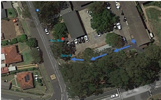
Exit & Entry of premises Via School Gate 3